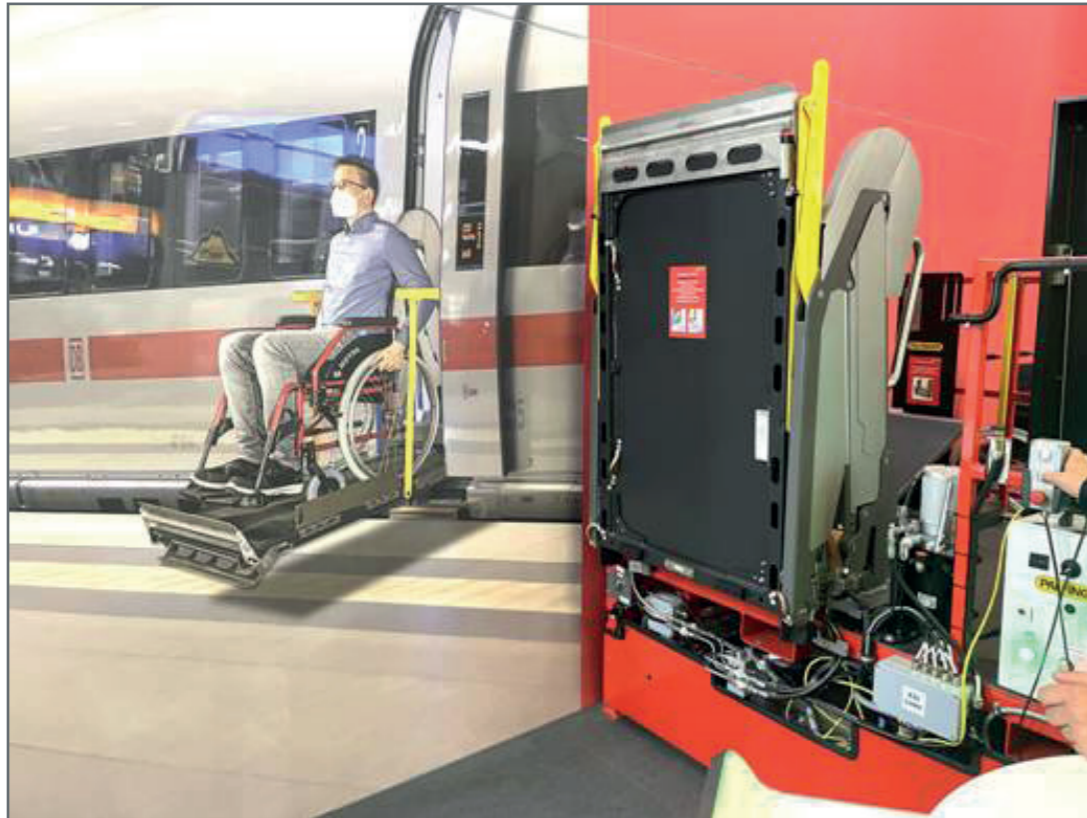
The Trainlift TRV 2 was specially developed for the train manufacturer's requirement and installed in a special door in the new ICE. When folded in, it is very space-saving (right)

People with reduced mobility often face great difficulties when using public transport. PALFINGER PASSENGER SYSTEMS specialises in passenger-access systems and, with more than 30 years of experience, it is one of the leading manufacturers of customised lifts and ramps for wheelchair users. Its products help people overcome difficulties and barriers to entry. For its latest development, KARL BUBENHOFER contributed its expertise and designed perfect, tailor-made powder coatings for Palfinger.