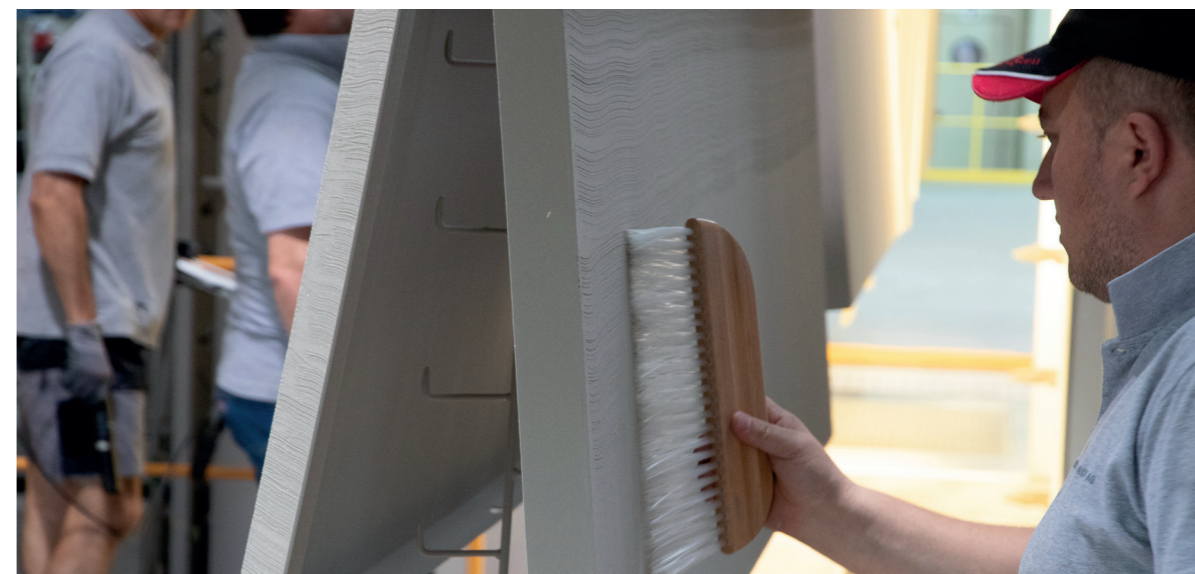
Manual and customised work is in demand.

The courage to venture into unknown territory, try out new approaches and achieve what seems at first to be impossible has proved to be rewarding for everyone involved. The facade of the cantonal pharmacy in Aarau has secured the building a special place in Swiss architectural history.